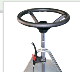
ERGONOMIC STEERING WHEEL AND PARKING BRAKE LEVER