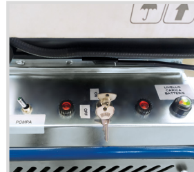
EASY AND INTUITIVE CONTROL PANEL