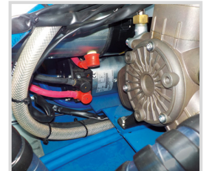
INTEGRATED COMPARTMENT WITH ELECTRIC MOTOR AND PUMP