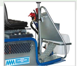
SMPL E ADVANCE FOOT PEDAL