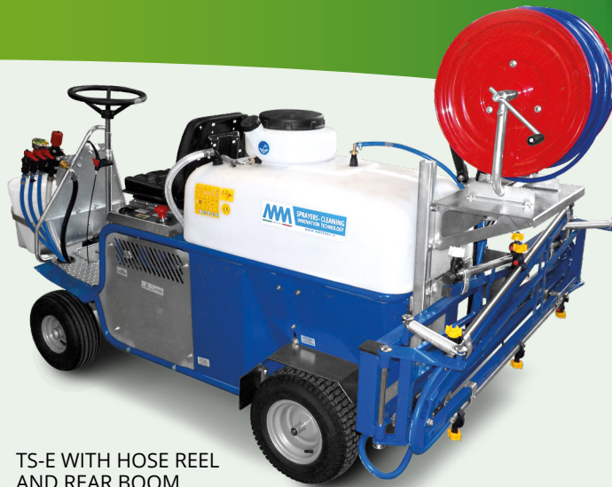
TS-E WITH HOSE REEL AND REAR BOOM