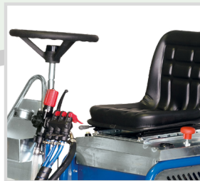
COMFORTABLE DRIVING PLACE WITH SEAT AND CONTROLS EASILY ACCESSIBLE