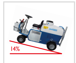
14% MAXIMUM SLOPE

Data, descriptions and images are provided for information only and they are not binding, they could be modified at any time without previous notice.