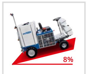
MAXIMUM SLOPE 8%.

Data, descriptions and images are provided for information only and they are not binding, they could be modified at any time without previous notice.