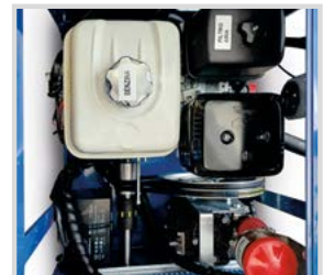
ENGINE COMPARTMENT AND INTEGRATED PUMP