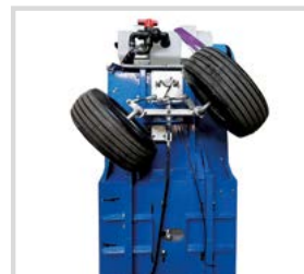
STEERING RANGE 250 cm