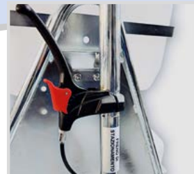
ERGONOMIC STEERING WHEEL AND PARKING BRAKE LEVER