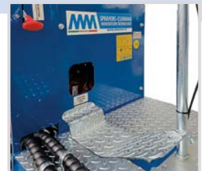
SIMPLE FOOT PEDAL FORWARDING