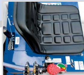
COMFORTABLE DRIVER'S SEAT WITH EASILY ACCESSIBLE SEAT AND CONTROLS