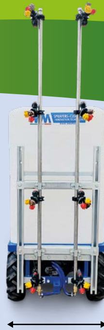
TS-S SLIM TRACTOR WITH VERTICAL BAR FOR TREATMENT TOMATOES (KITPOM)